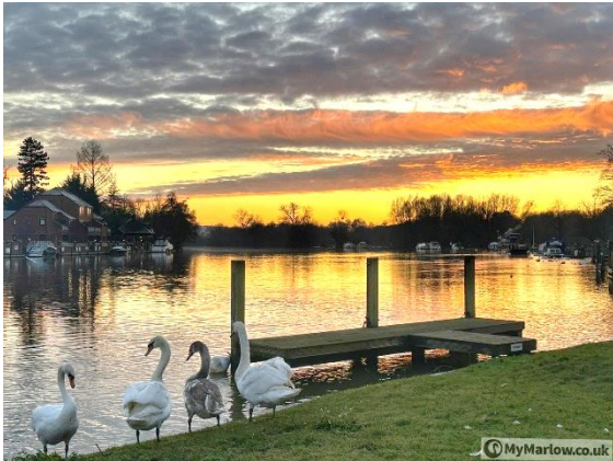
With thanks to MyMarlow

During February it's winter opening hours: Sundays only from 2-4pm.